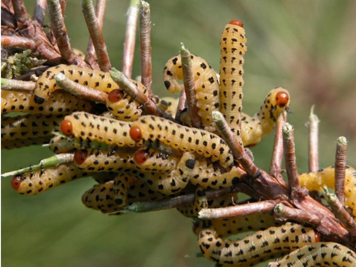
Red Pine sawfly larvae