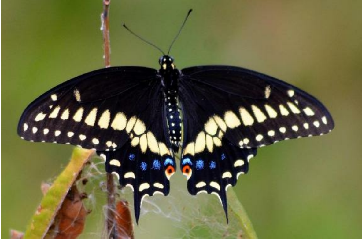
Black Swallowtail Butterfly