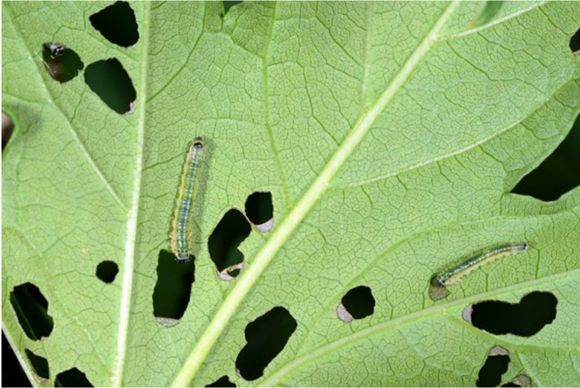
Mallow Sawfly larvae

caterpillars. And, because there is a definite difference between the two, knowing that difference is important if you want to control them because they eat many of the same things like leaves etc.